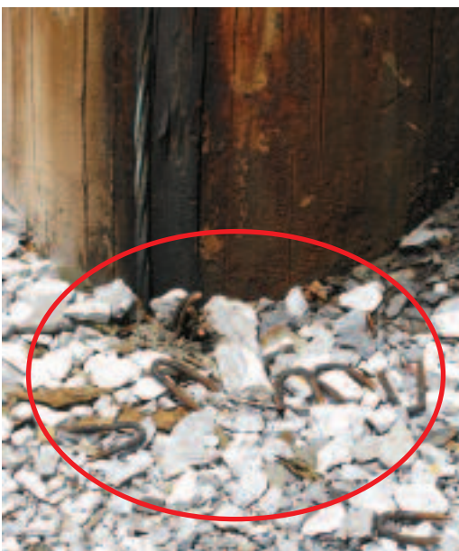
Six staples lay at the bottom of this pole where copper was stolen. If you look closely, you can see the stub of the cut wire next to the ground wire.