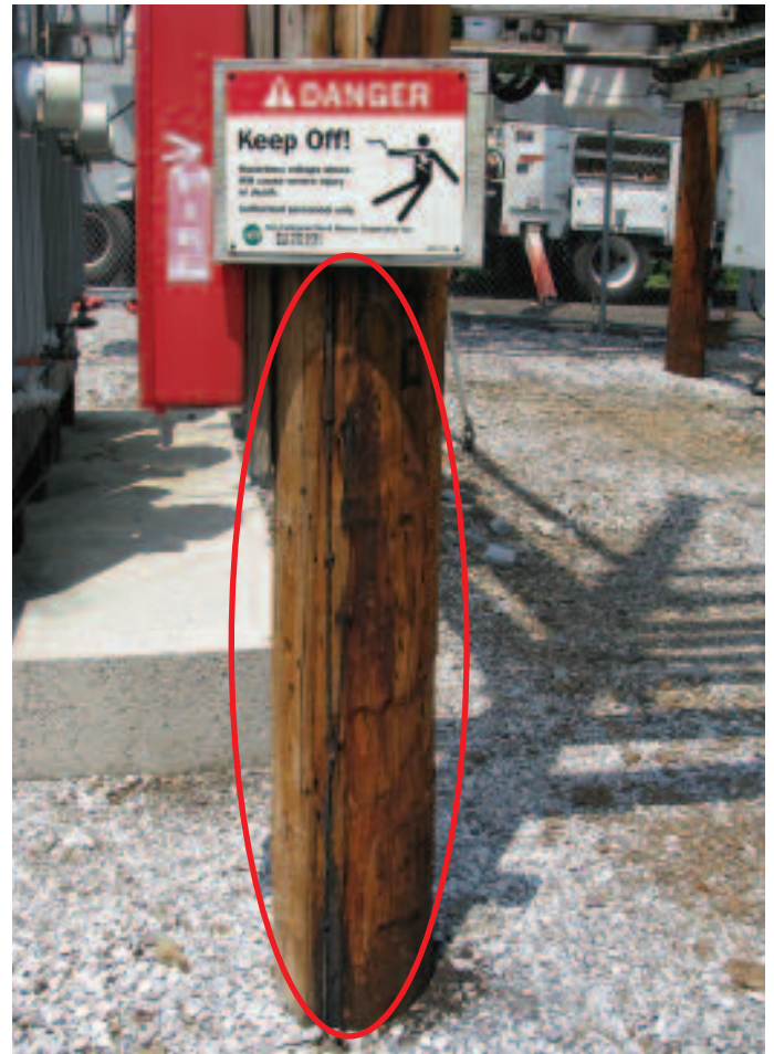
This pole is located within the substation. A 4-foot section of wire is missing. One of our warning signs is attached to this pole.