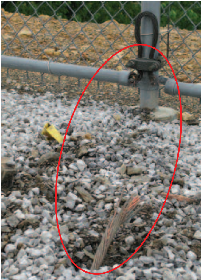
This photo shows the missing section of copper between the fence post and the ground grid.