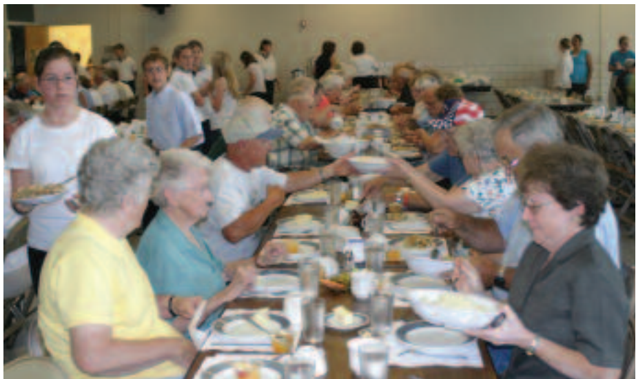
TURKEY TIME: New Enterprise REC members enjoy a turkey dinner served by Northern Bedford County High School band members and parents at last year's annual meeting.

If you have paid a membership fee and have not received an official annual meeting notice and reservation card in the mail by May 25, please call our office. ☎