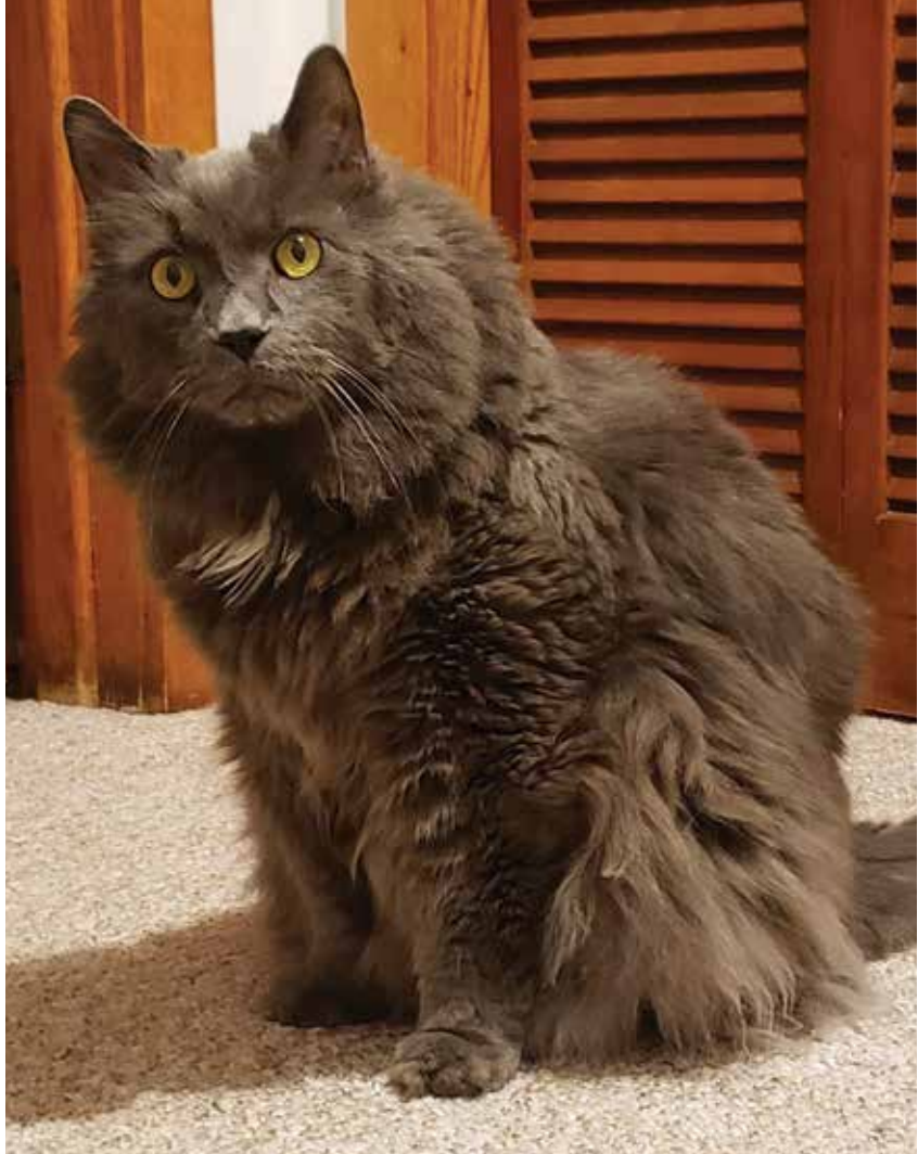
OSCAR, THE COMFY CAT: You can make your home more comfortable this winter for everyone, including the family pets, without taking a big "bite" out of your budget. Just ask Oscar.

If possible, elevate your pet's bed so it's not placed directly on a cold floor. An old chair or sofa cushion works well. If you don't use a dog bed, take some old blankets and create a donut shape on the cushion so the dog can snuggle and "nest" within the blanket. You can do the same for cats, but on a smaller scale. Blankets enable pets to nestle into them, even when they aren't tired, and pro-