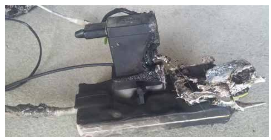
SAY NO TO KNOCKOFFS: Cheap, generic chargers can cause big problems for you and your devices.

Along with a potential burn and fire hazard, using cheaply made charging components and devices can also cause shock and electrocution. Serious potential dangers aside, they may also cost you more in the long run since they can cause damage to your phone,